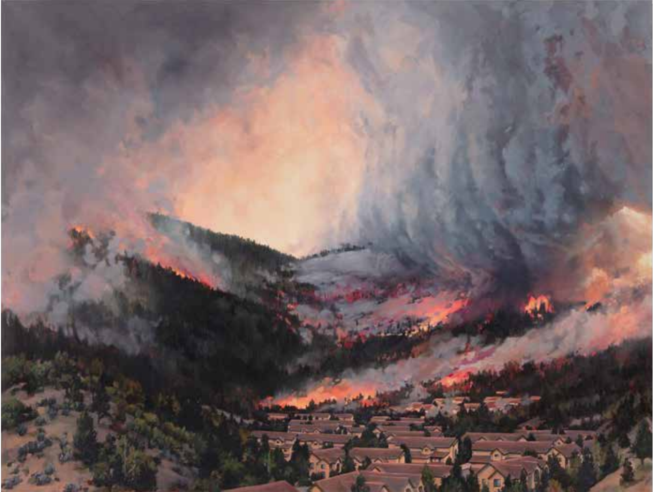
ERIKA OSBORNE, On the Edge of Sublime , 2015, oil on linen, 36 x 46 inches.

Erika Osborne depicts a wildfire in part of the wildland-urban interface, the transition zone between wildlands and human development. In recent decades millions of people have settled in these zones in California. Communities living in these expanding areas are at the greatest risk of experiencing catastrophic wildfires, partly because they are adjacent to vegetation that can fuel fires and partly because humans often ignite fires.